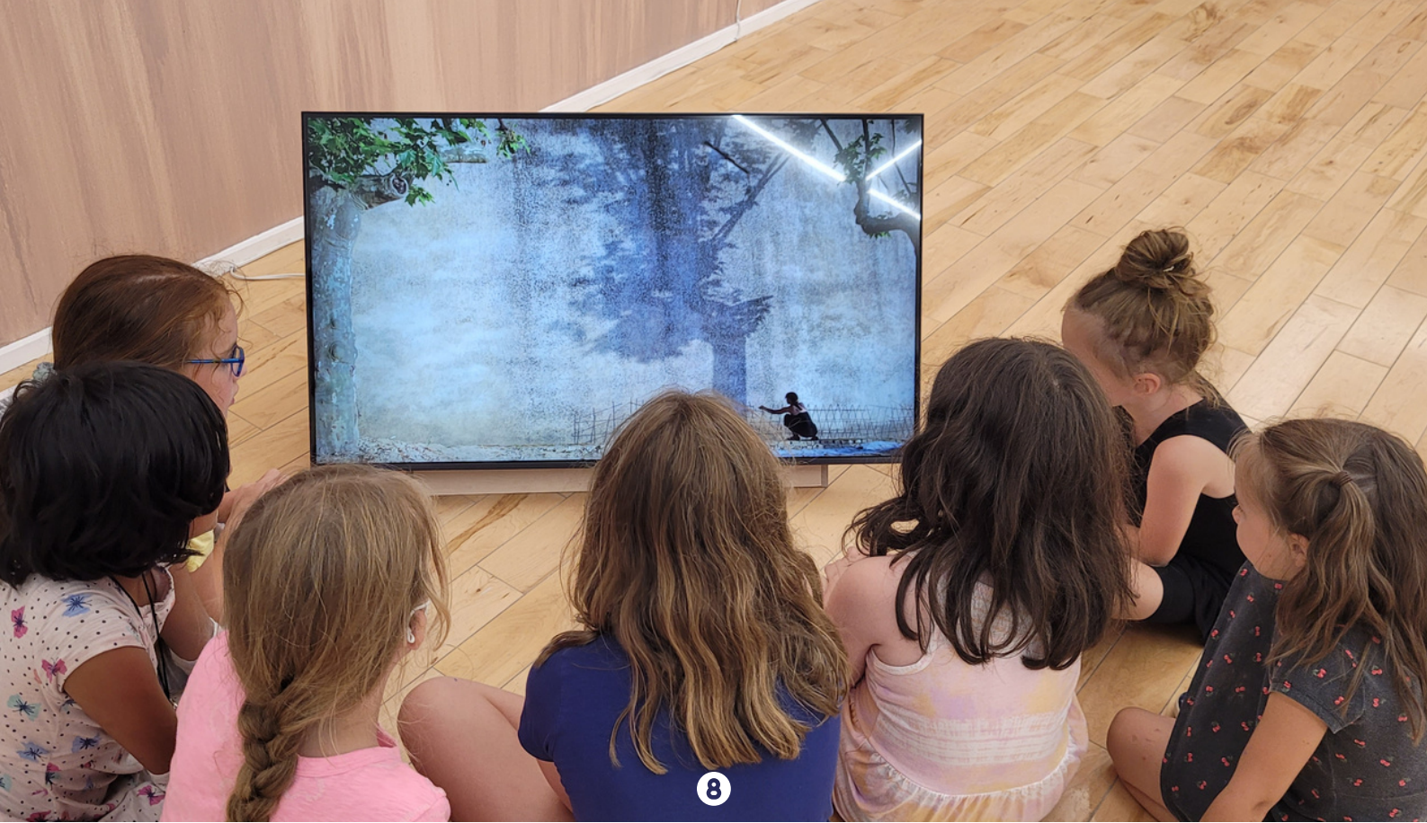
Kids Summer Camp Programming in Main Gallery